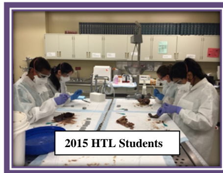
2015 HTL Students